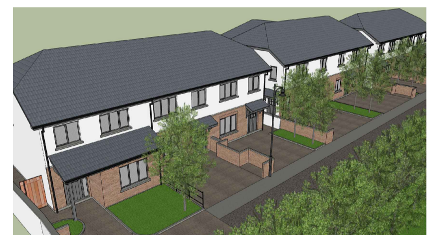
04 3D Images