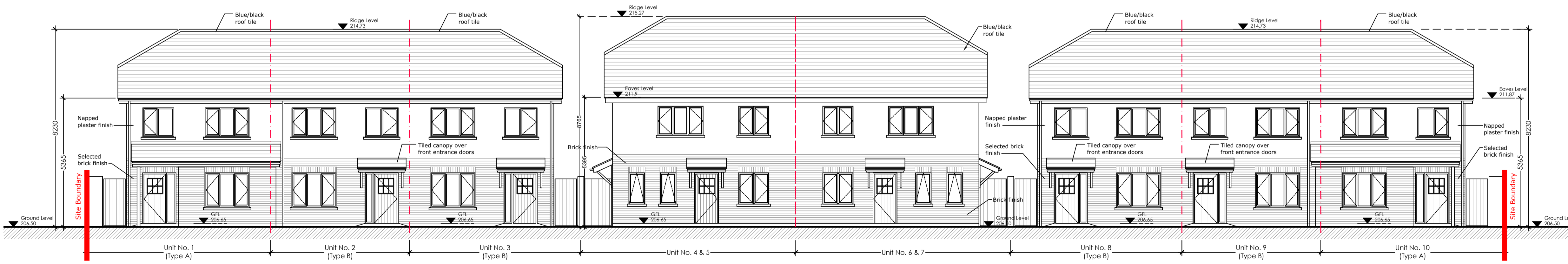
02 Proposed Site Section A-A / Street Elevation