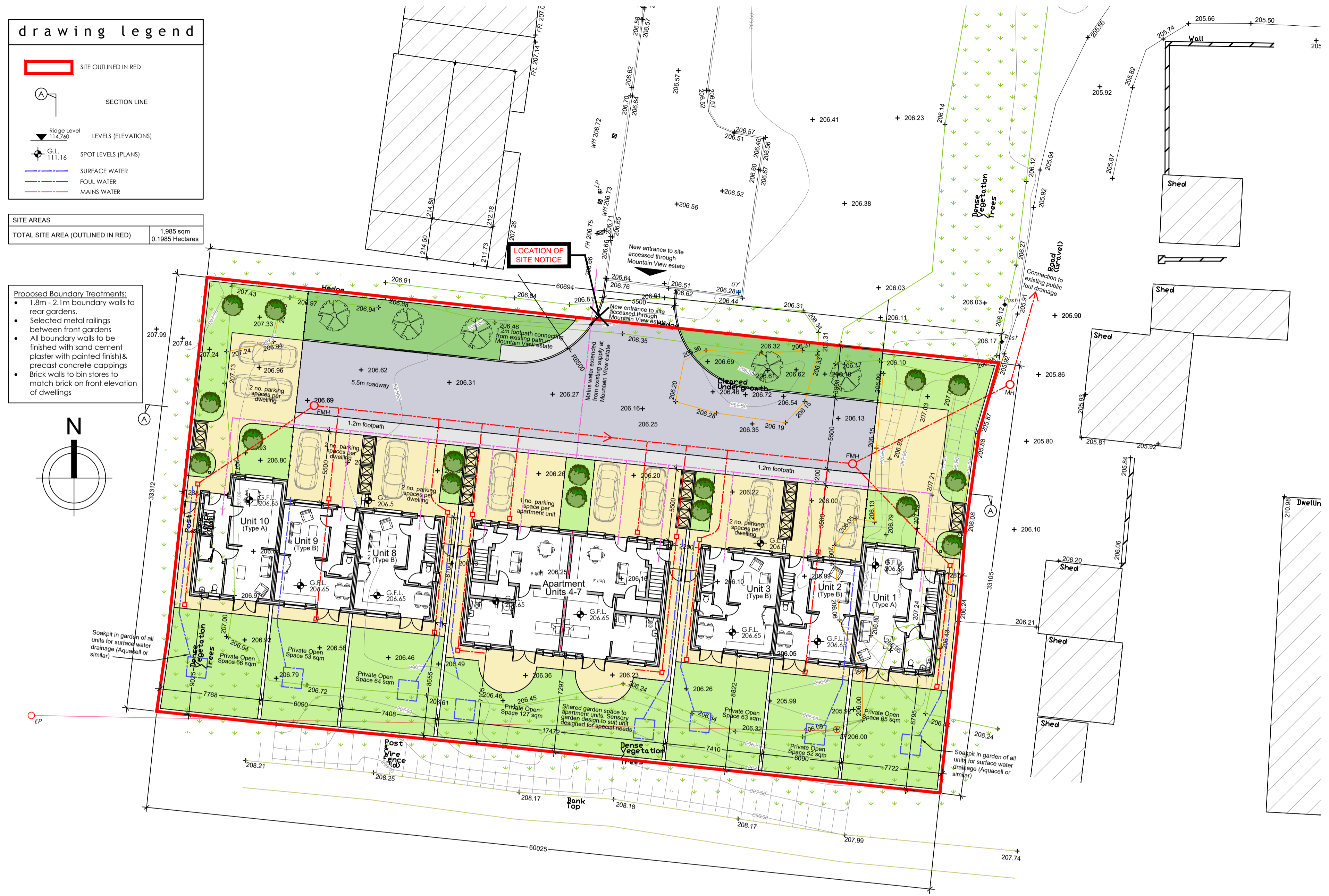
01 Proposed Site Plan